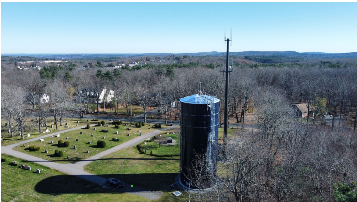
Ellis Road Water Storage Tank at Mount Pleasant Cemetery

This year the 370,000 gallon Ellis Road water storage tank built in 1955 was replaced with a same sized glass fused to steel tank. In 2023, the 1 million gallon Shady Avenue water storage tank built in 1970 is scheduled for rehabilitation.