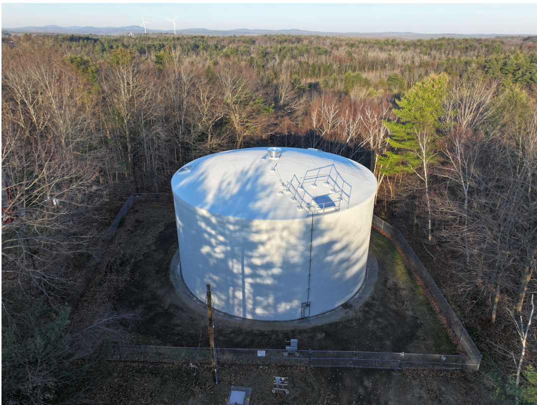
Shady Avenue Water Storage Tank on Goodridge Drive

This year the 1 million gallon Shady Avenue water storage tank built in 1970 was rehabilitated.